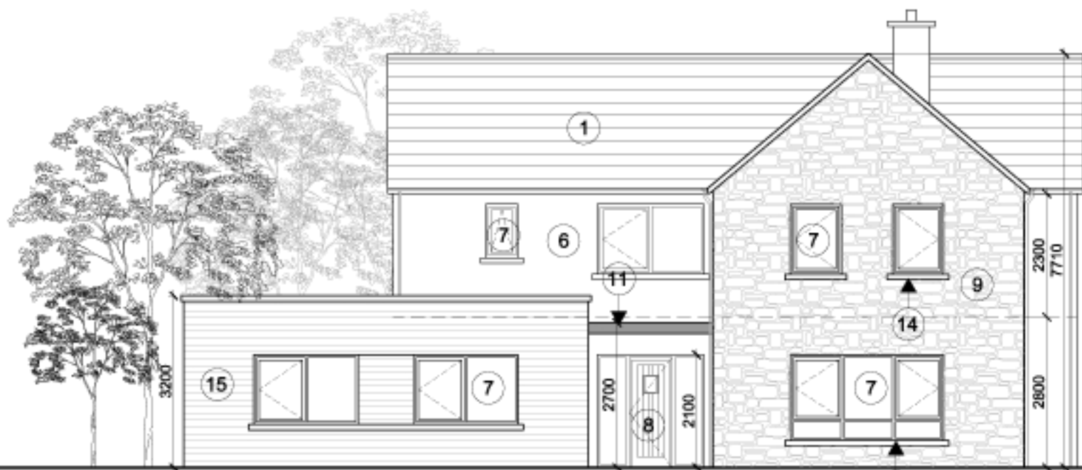
01 FRONT ELEVATION TYPE 1 1:100 @ A3