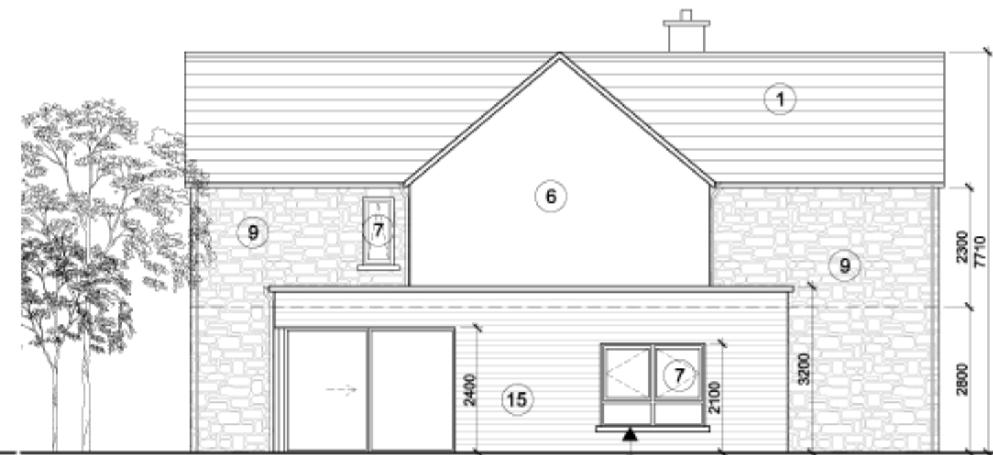
02 SIDE ELEVATION TYPE 1 1:100 @ A3